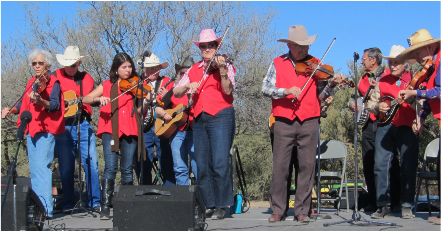
Last Year's Whole Lineup

The picture below is of last year's performance. Will you be in this year's picture?