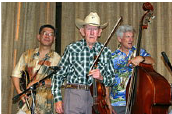
Kenny Baker bluegrass fiddler