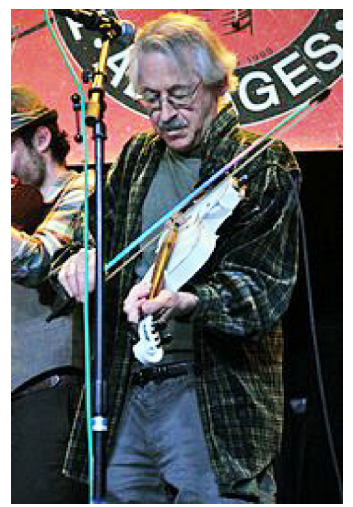
Peter Stampfel The Holy Modal Rounders

A fiddle is a bowed string musical instrument, most often a violin. It is a colloquial term for the violin, used by players in all genres including classical music. Although violins and fiddles are essentially synonymous, the style of the music played may determine specific construction differences between fiddles and classical violins. For example, fiddles may optionally be set up with a bridge with a flatter arch to reduce the range of bow-arm motion needed for techniques such as the double shuffle, a form of bariolage involving rapid alternation between pairs of adjacent strings.[2] To produce a "brighter" tone, compared to the deeper tones of gut or synthetic core strings, fiddlers often use steel strings. The fiddle is part of many traditional (folk) styles, which are typically aural traditions—taught 'by ear' rather than via written music.