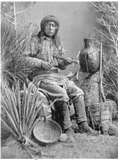
Chasi Warm Springs Apache 1886