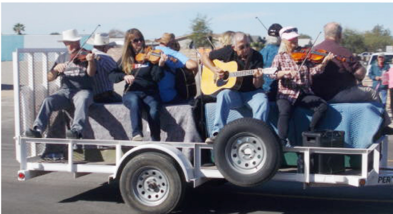
Territorial (Yuma) members playing in the Hank's Day Parade